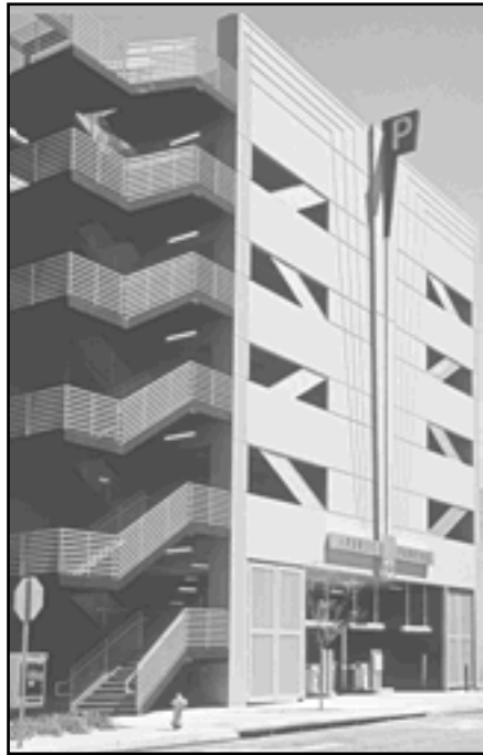
2005 Project of the Year – the Pennington Street Garage is a solar-powered and fully automated, 24-hour facility.

TDOT received this award for the Pennington Street Garage , located Downtown at 110 E. Pennington Street. The garage was recognized for its innovative use of solar technology and