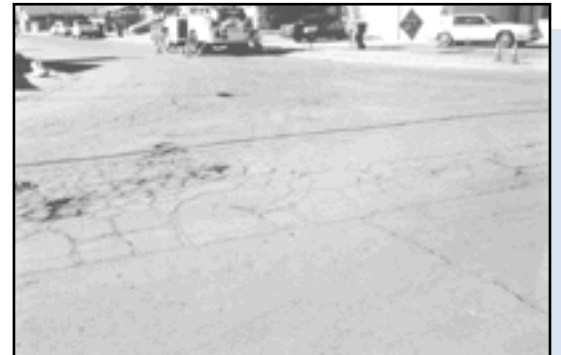
Many of Tucson's worst neighborhood streets are now being maintained, thanks to $11 million earmarked by Mayor and Council.

Other neighborhoods that have benefited from the maintenance program include Colonia del Valle, Glen Heights and Amphi. The neighborhoods encompassed by Barrio Viejo, Barrio Santa Rosa, and Sunnyside neighborhood associations are next, as soon as the weather warms up and chip sealing can resume in the early spring.