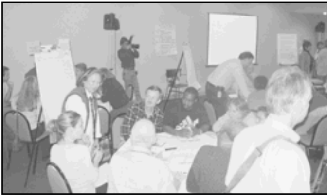
Citizens share their observations about Grant Road's "sense of place" at a recent workshop.

One of the Regional Transportation Authority (RTA) projects approved by voters in last May's election was the improvement of Grant Road between Swan and Oracle Roads. Before the project's design effort kicks into high gear, TDOT is engaging the community in a series of "Community Conversations" about the corridor. Our goal was to hear what people had to say about Grant Road's "sense of place," that is the unique feelings, memories and qualities associated with it.